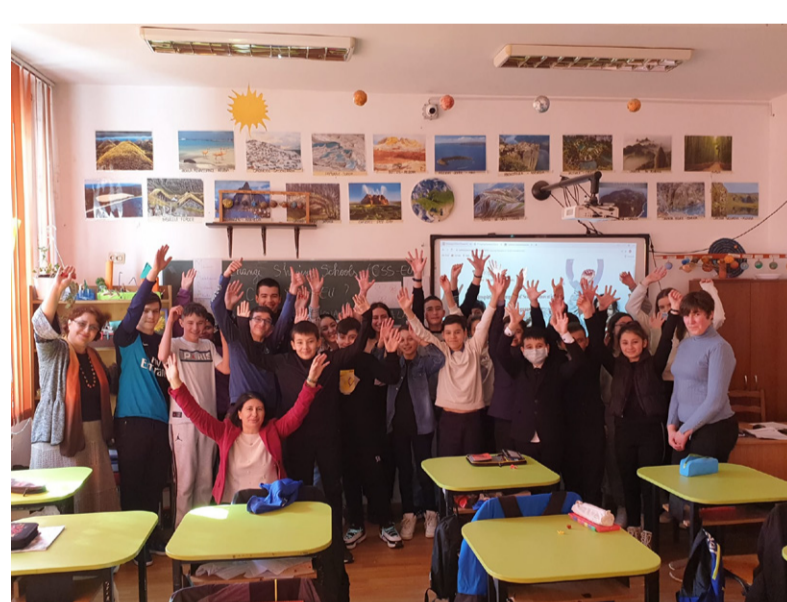
Romanian school implementing the CSS-EU project

Project partners have already prepared the necessary training material for the implementation phase, which are also available in Croatian, Greek, Romanian and Serbian. The SIE resources will be freely available for any school/ teacher that wants to embrace the SIE methodology, upon request to the local ambassador.